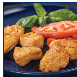
Boneless Roasted Chicken Bites #40011