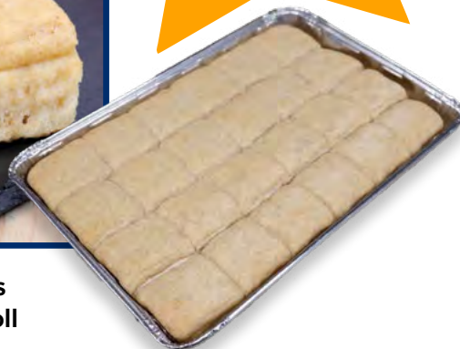
WG Sister Schubert's Parker House Style Roll #24300

CONVENIENTLY PACKAGED IN OVENABLE TRAYS!