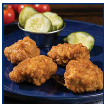
Whole Grain Breaded Dill Chunks #64015

Whole muscle chicken breast meat perfect for dipping, in wraps, and more!