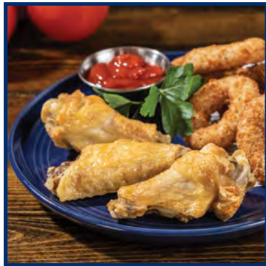
Fully Cooked Roasted Wings #34007

Change up your chicken menu with juicy, bone-in options.