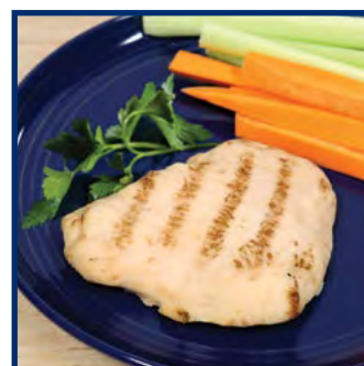
Grilled Chicken Breast Fillet #62006