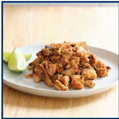
Grilled Chopped Chipotle Seasoned Chicken #28802

Juicier and more flavorful dark meat chicken to increase meal satisfaction and consumption.