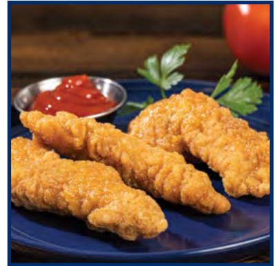
NAE Whole Grain Breaded Tender Fritter #63250