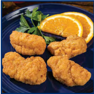
NAE Whole Grain Breaded Breast Bite #67630

The delicious, high-quality chicken you expect, made with no antibiotics ever.