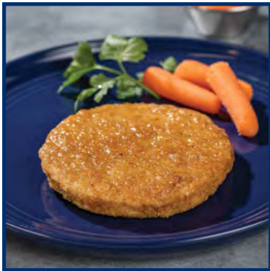
Whole Grain Breaded Patty #50415

Made with ground chicken breast meat, these formed options provide consistent portions and great quality.