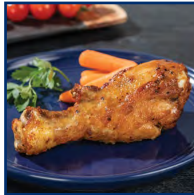
Fully Cooked, Oven Roasted Chicken Drumsticks #34009