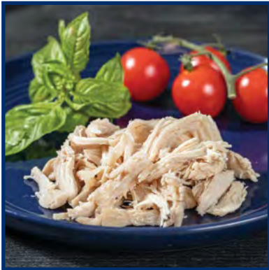
Rotisserie Pulled Chicken #10404

Speed scratch made simple with our fully-cooked rotisserie chicken, chicken strips, and diced chicken.