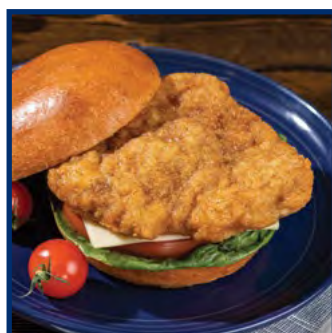
Whole Grain Breaded Dill Flavored Fillet #60615