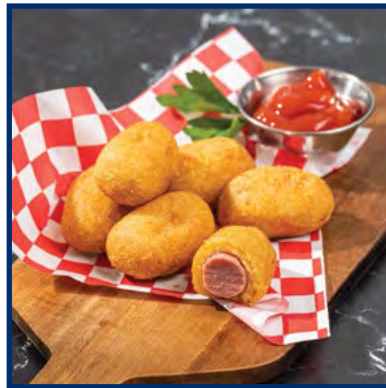
Whole Grain Mini Corn Dogs (Chicken Thighs) #64019