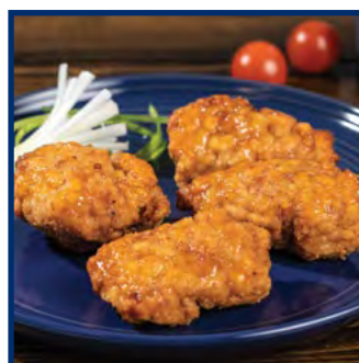
Whole Grain Breaded Asian Style Glazed Chunks #64130