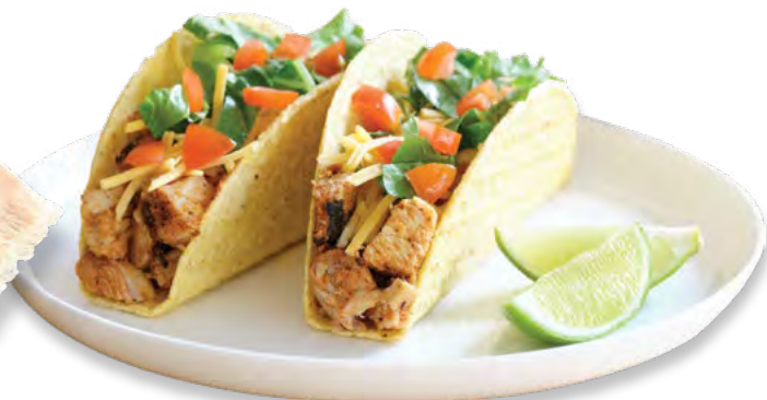
Chipotle Chicken Tacos