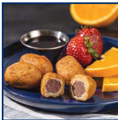
Whole Grain Mini Maple Pancake Chicken Bites #64014