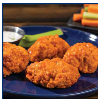
Whole Grain Breaded Buffalo Glazed Chunks #64230