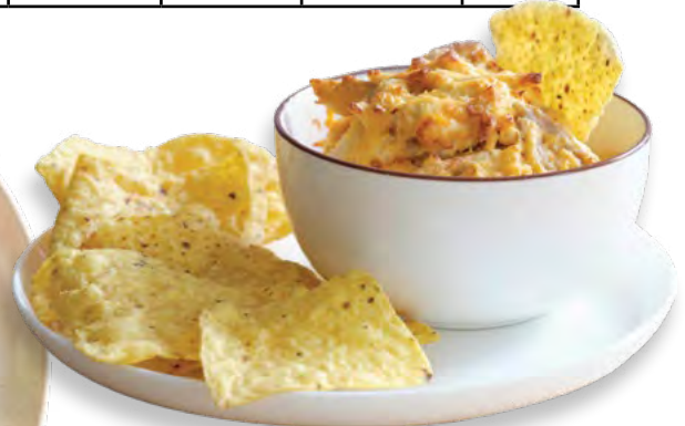
Buffalo Chicken Dip