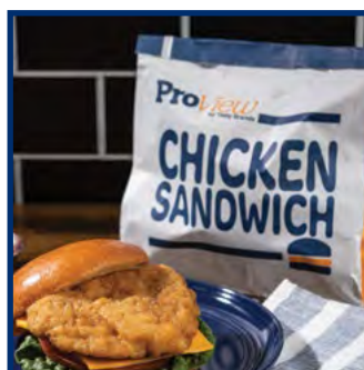
Whole Grain Breaded Savory Fillet with Foil Bags #60815