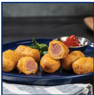
Whole Grain Mini Corn Dog #64010

Crispy coated chicken and pepperoni franks, perfect for dipping!