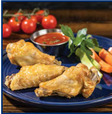
NAE Fully Cooked Roasted Wings #34006