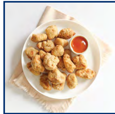
Whole Grain Tempura Battered Chicken Chunks #64640