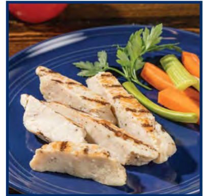
Fajita Chicken Breast Strips - Seasoned #28001