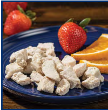
Non Marinated Diced Chicken #28031