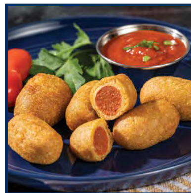
Whole Grain Mini Pepperoni Corn Dogs #64018