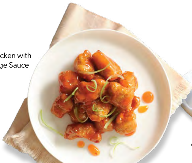
Tempura Chicken with Hunan Orange Sauce