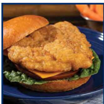
Whole Grain Breaded Savory Fillet #60715

Whole muscle chicken breast meat for a high-quality, restaurant-style fillet.