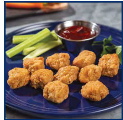
Whole Grain Breaded Popcorn Chicken #43015