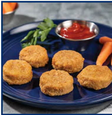
Whole Grain Breaded Nugget #40015