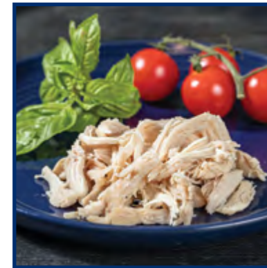
Rotisserie Pulled Chicken #10404

Speed scratch made simple with our fully-cooked rotisserie chicken, chicken strips, and diced chicken.