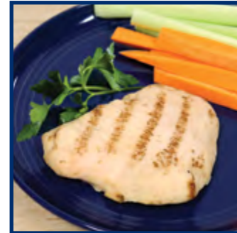
Grilled Chicken Breast Fillet #62006