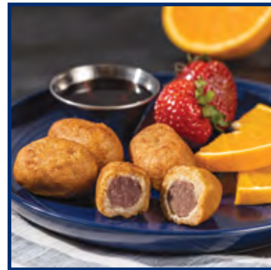
Whole Grain Mini Maple Pancake Chicken Bites #64014