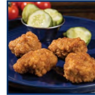
Whole Grain Breaded Dill Chunks #64015

Whole muscle chicken breast meat perfect for dipping, in wraps, and more!