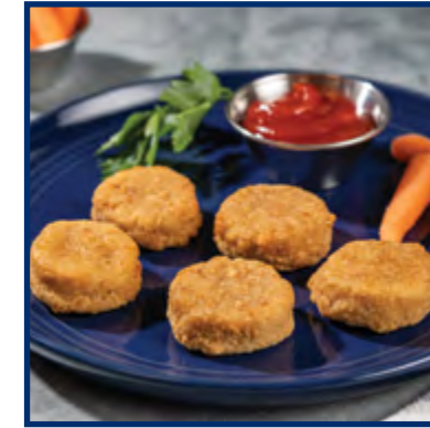
Whole Grain Breaded Nugget #40015