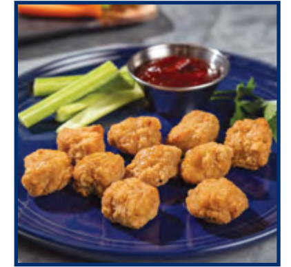
Whole Grain Breaded Popcorn Chicken #43015