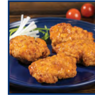
Whole Grain Breaded Asian Style Glazed Chunks #64130