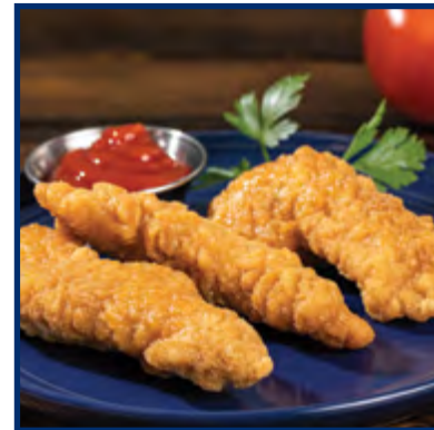
NAE Whole Grain Breaded Tender Fritter #63250