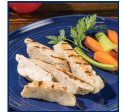
Fajita Chicken Breast Strips - Seasoned #28001