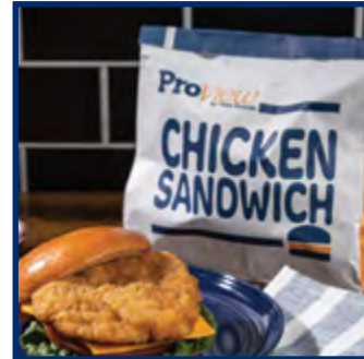
Whole Grain Breaded Savory Fillet with Foil Bags #60815