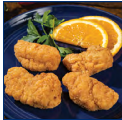
NAE Whole Grain Breaded Breast Bite #67630

The delicious, high-quality chicken you expect, made with no antibiotics ever.