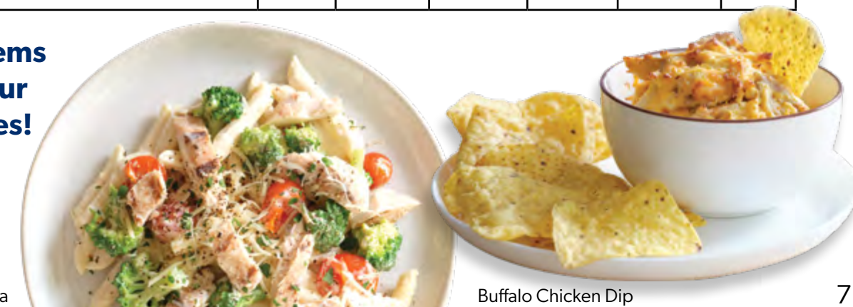
Tuscan Chicken Pasta

The perfect items to add into your favorite recipes!