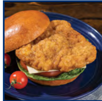
Whole Grain Breaded Dill Flavored Fillet #60615