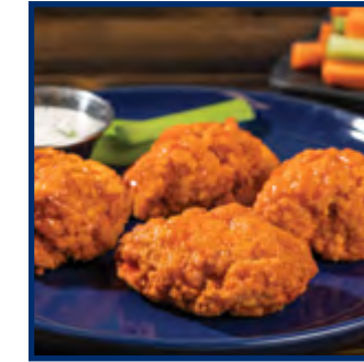
Whole Grain Breaded Buffalo Glazed Chunks #64230