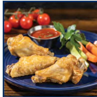
NAE Fully Cooked Roasted Wings #34006