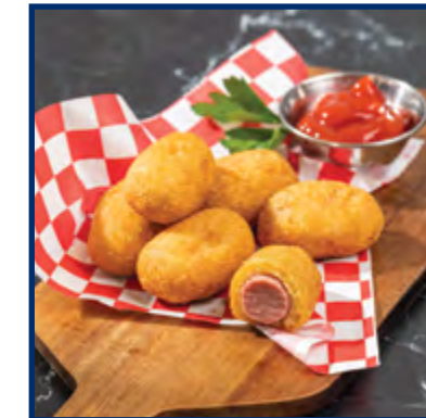
Whole Grain Mini Corn Dogs (Chicken Thighs) #64019