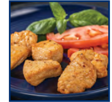
Boneless Roasted Chicken Bites #40011