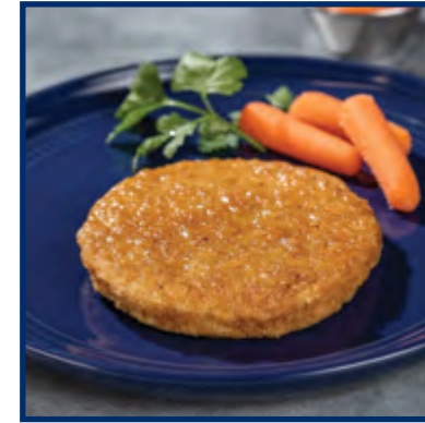
Whole Grain Breaded Patty #50415

Made with ground chicken breast meat, these formed options provide consistent portions and great quality.