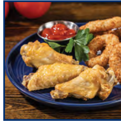
Fully Cooked Roasted Wings #34007

Change up your chicken menu with juicy, bone-in options.