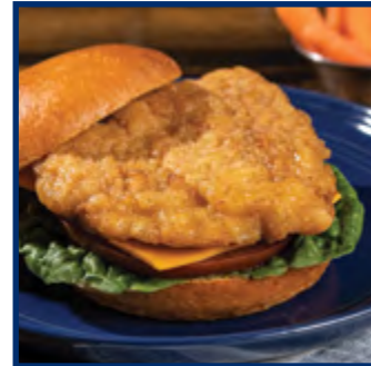
Whole Grain Breaded Savory Fillet #60715

Whole muscle chicken breast meat for a high-quality, restaurant-style fillet.