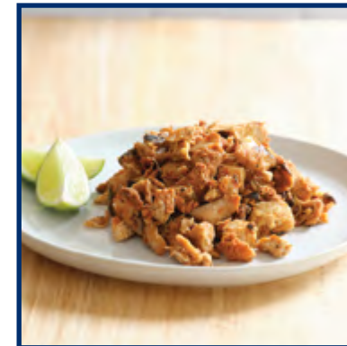
Grilled Chopped Chipotle Seasoned Chicken #28802

Juicier and more flavorful dark meat chicken to increase meal satisfaction and consumption.