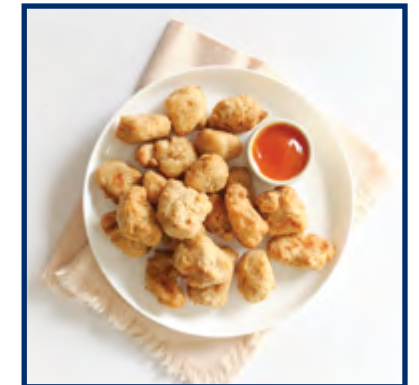
Whole Grain Tempura Battered Chicken Chunks #64640