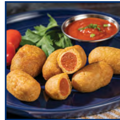
Whole Grain Mini Pepperoni Corn Dogs #64018