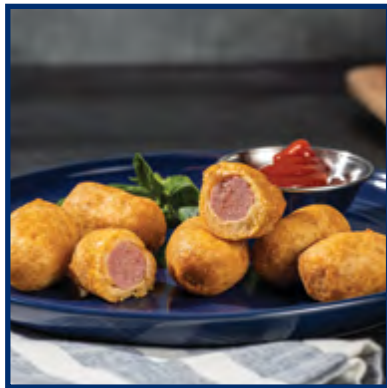
Whole Grain Mini Corn Dog #64010

Crispy coated chicken and pepperoni franks, perfect for dipping!