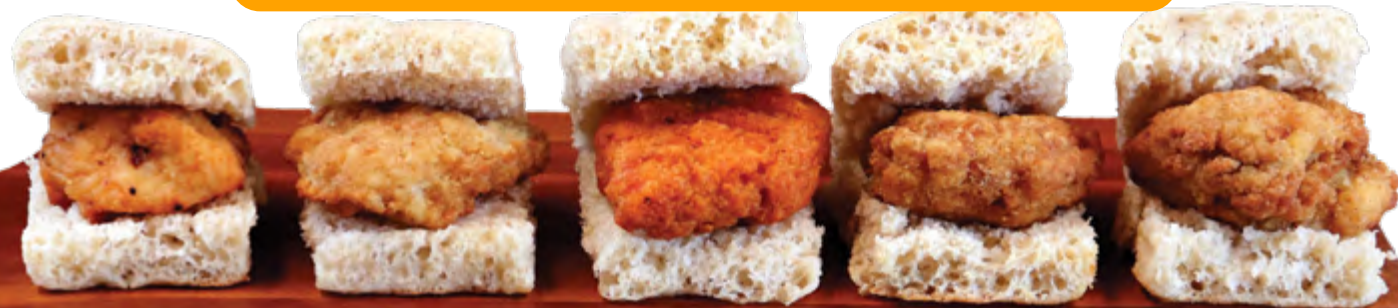
#40011 Boneless Roasted Chicken Bites