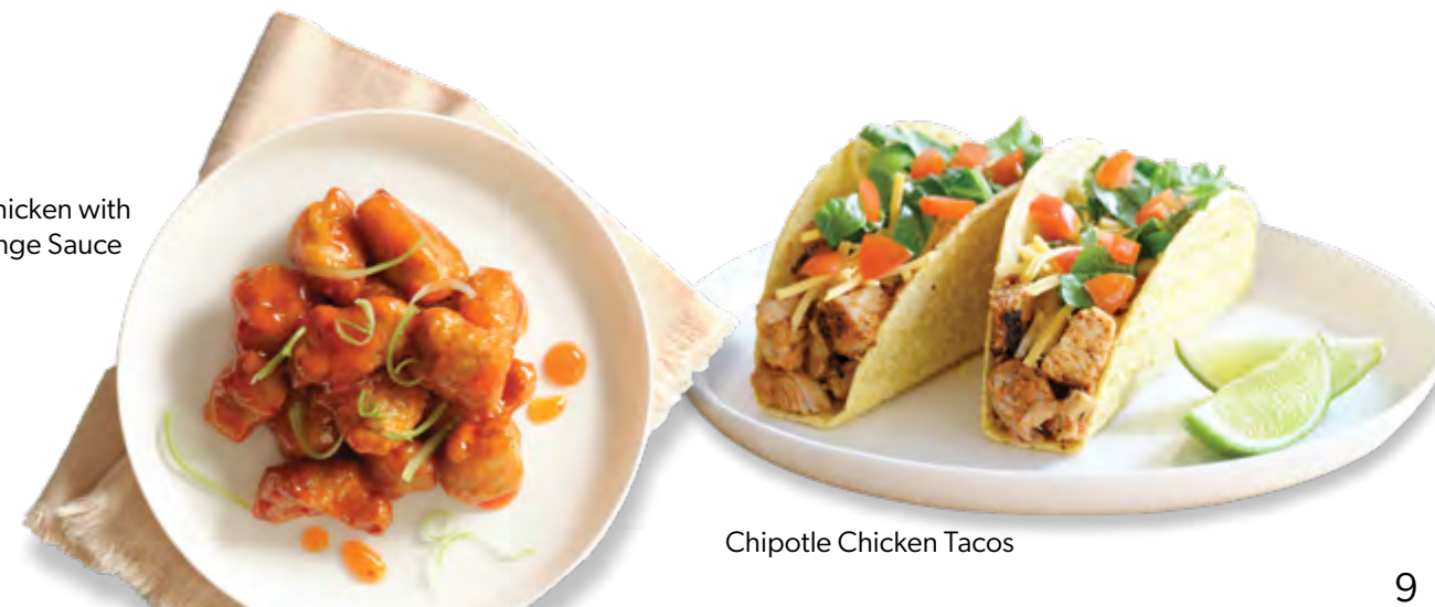
Chipotle Chicken Tacos